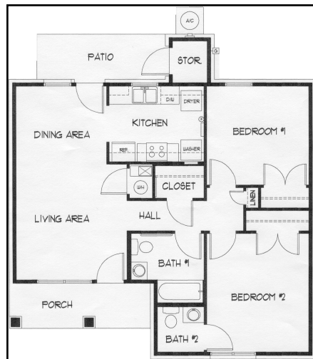
TWO BEDROOM OPTION